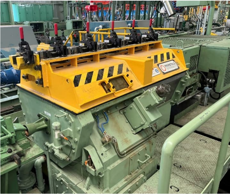
One of the newest solutions from Primetals Technologies – the eDrive mini-finishing mill.

Baoshan Iron and Steel, a subsidiary of Baowu Steel Group located in Shanghai, PRC, is a comprehensive steel service company specializing in the processing, sales, and technical services of stainless steel and carbon steel alloys, including high-quality wire rod products, since the late 1990s.